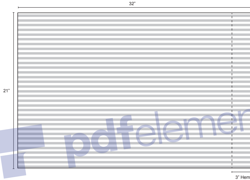
Photo Detail - Stripe Pattern